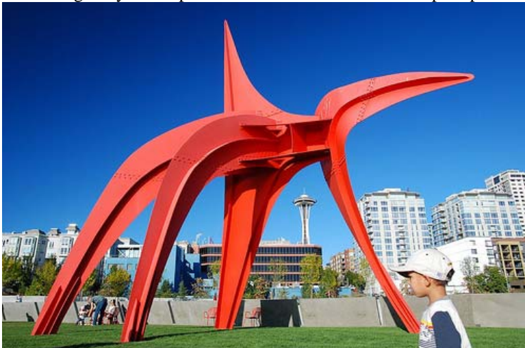
Seattle Aquarium (Waterfront)

A stunning array of sculpture inhabits 9 acres of free and open space for art on Seattle's waterfront