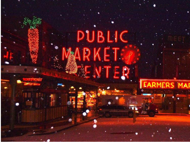
Seattle Art Museum (Downtown)

Drop in to see extensive permanent collections, exciting international exhibitions, and a diverse lineup of Programs