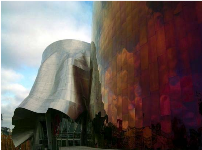
Seattle Asian Art Museum

EMP|SFM is the place where music meets science fiction. Learn about two popular passions through state-of-the-art exhibitions and hands-on interaction—all under one architecturally amazing roof!