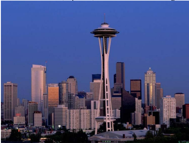
Experience Music Project|Science Fiction Museum and Hall of Fame (Seattle Center)

The 605-foot tall Space Needle was completed in December 1961 and officially opened on the first day of the Seattle World's Fair, April 21, 1962. It has a revolving restaurant, SkyCity at 500 feet.