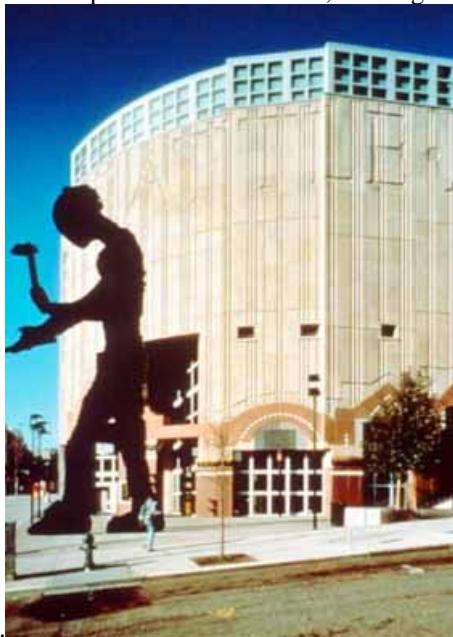
Olympic Sculpture Park (Waterfront)

Drop in to see extensive permanent collections, exciting international exhibitions, and a diverse lineup of Programs