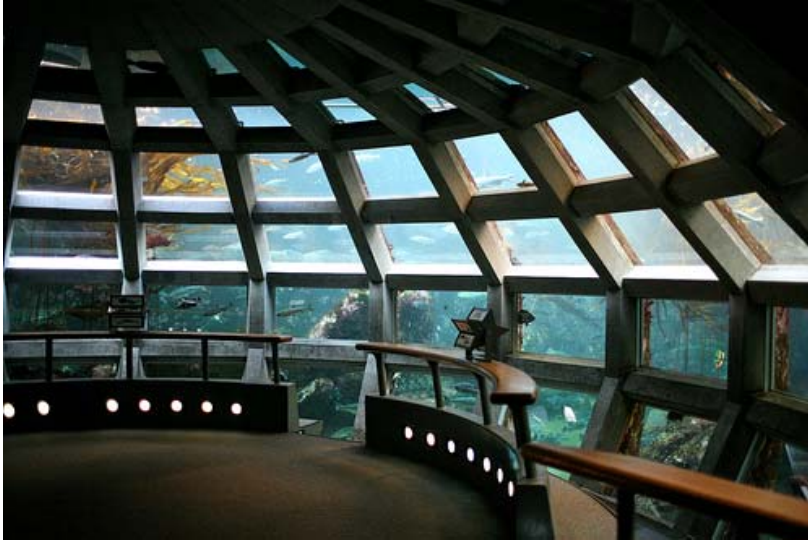
Space Needle (Seattle Center)

The 605-foot tall Space Needle was completed in December 1961 and officially opened on the first day of the Seattle World's Fair, April 21, 1962. It has a revolving restaurant, SkyCity at 500 feet.